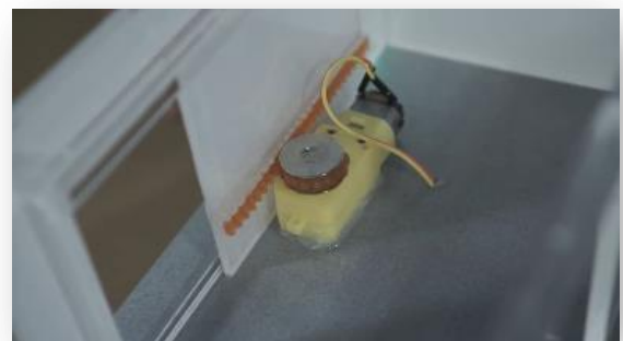
Figure 4. Sliding Door Activator