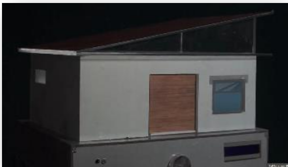
Figure 2. Program Realization

In use, when the Infrared Sensor detects an object such as a human hand, it will activate the MLX90614 Temperature Sensor. After that, the MLX90614 Temperature Sensor will read how high the temperature of the object is so that the results of these readings will be displayed on a 16x2 LCD screen. When the temperature read is a normal temperature between 36 – 37 °C it will activate the DC Motor which has been fitted with gear to rotate so that the door can open automatically and the LED will light up for a few seconds as a sign of safety. When the recorded temperature is not normal, the DC Motor will not be activated but the Buzzer and LED will sound and flash several times within a few seconds as a warning signal. As for the design of the Realization Program, it can be seen in Figure 2.