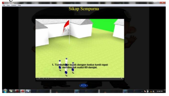
Figure 5. About display

In this display we can choose to play the application using the buttons on the system parts in rows. The main menu display can be seen in Figure 5.