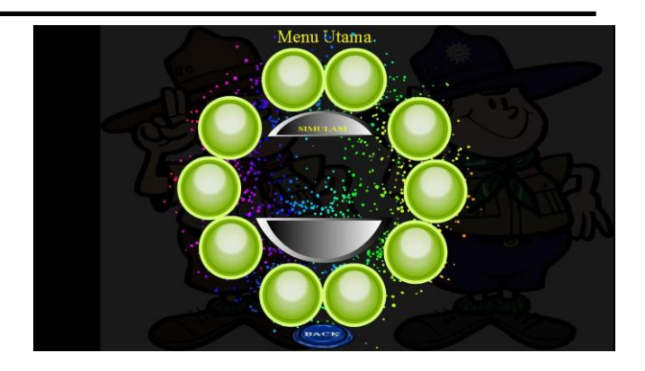
Figure 4. About display

In this display we can choose to play the application using the buttons on the main menu display display in Figure 4 below.