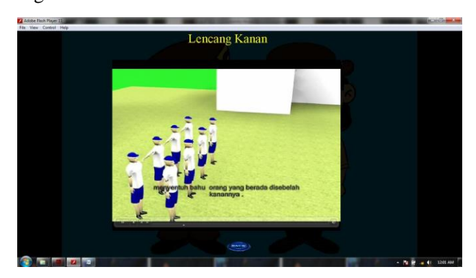
Figure 3. Dres Right display

This display is a display for viewing information about the author. We can see the about display in Figure 3 below.