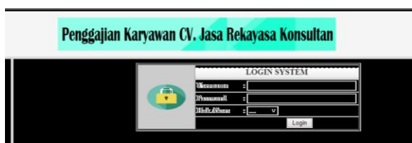
Figure 3. Login View

This login display appears when the program is run. The login form is used to restrict other users who do not have access rights to the system.