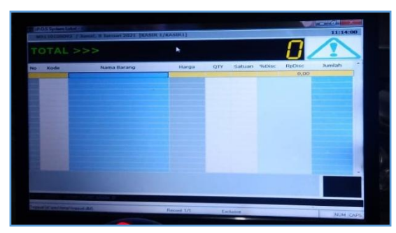
Figure 3. Item sales menu form

When the author analyzes the process of running the application, then after logging in, the page below immediately appears, figure 3.